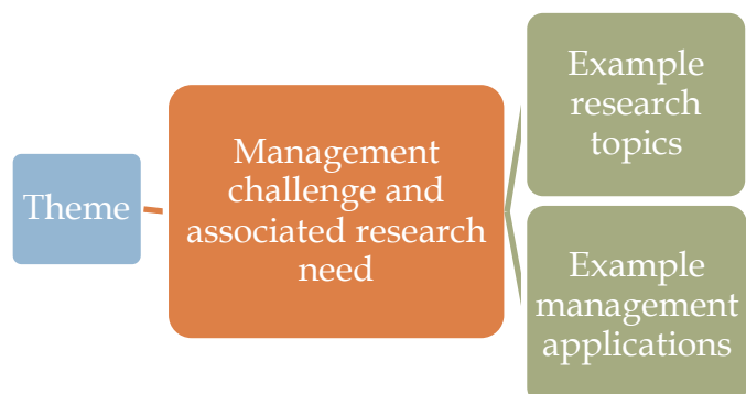
Framework for presentation of NRM research needs

This integrated research framework is organised into five focal research themes as well as four cross-cutting topics that apply across all themes (see page opposite). It is expected that all four cross-cutting topics will be addressed at the same time as knowledge gaps within a focal management challenge.